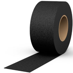
HENSOTHERM® 7 KS Gewebe (fabric)