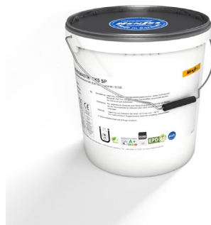
HENSOMASTIK® 5 KS SP (filler)