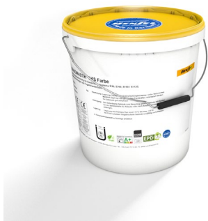
HENSOMASTIK® 5 KS Farbe

It do not serve in lieu of the details in the underlying European Technical Assessment ETA 20/1309.