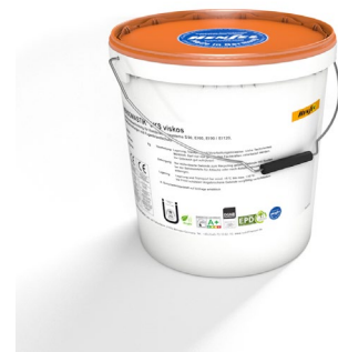
HENSOMASTIK® 5 KS (viscous)