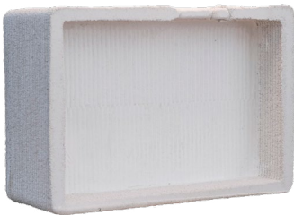
C-FORM fire protection cut-out